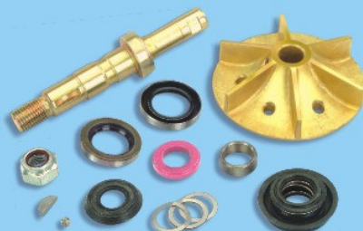
Water Pump Kit