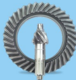
Crown Wheel & Pinion 8TG / 10TG