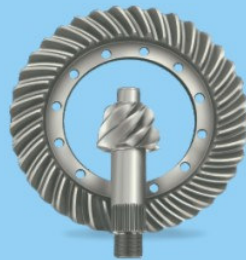
Crown Wheel & Pinion Bolt Type