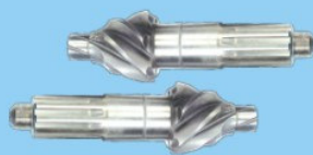
Pinion 8TG / 10TG